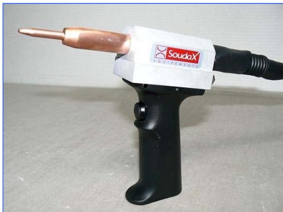
PSD micro push welder (Pistol design)