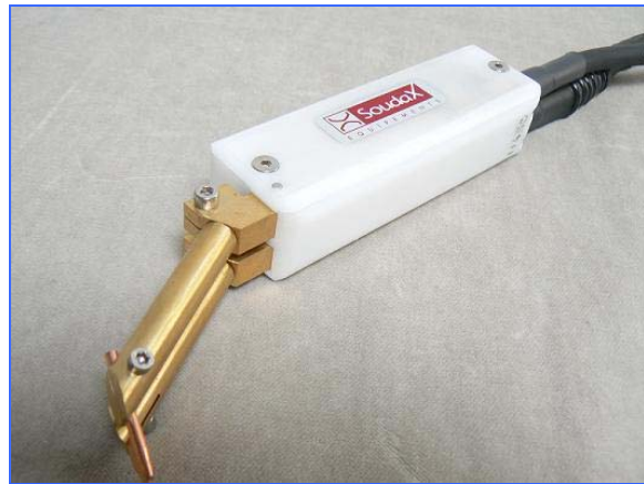
Micro push welder (Double point design)