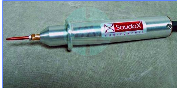
Micro push welder (Pin)